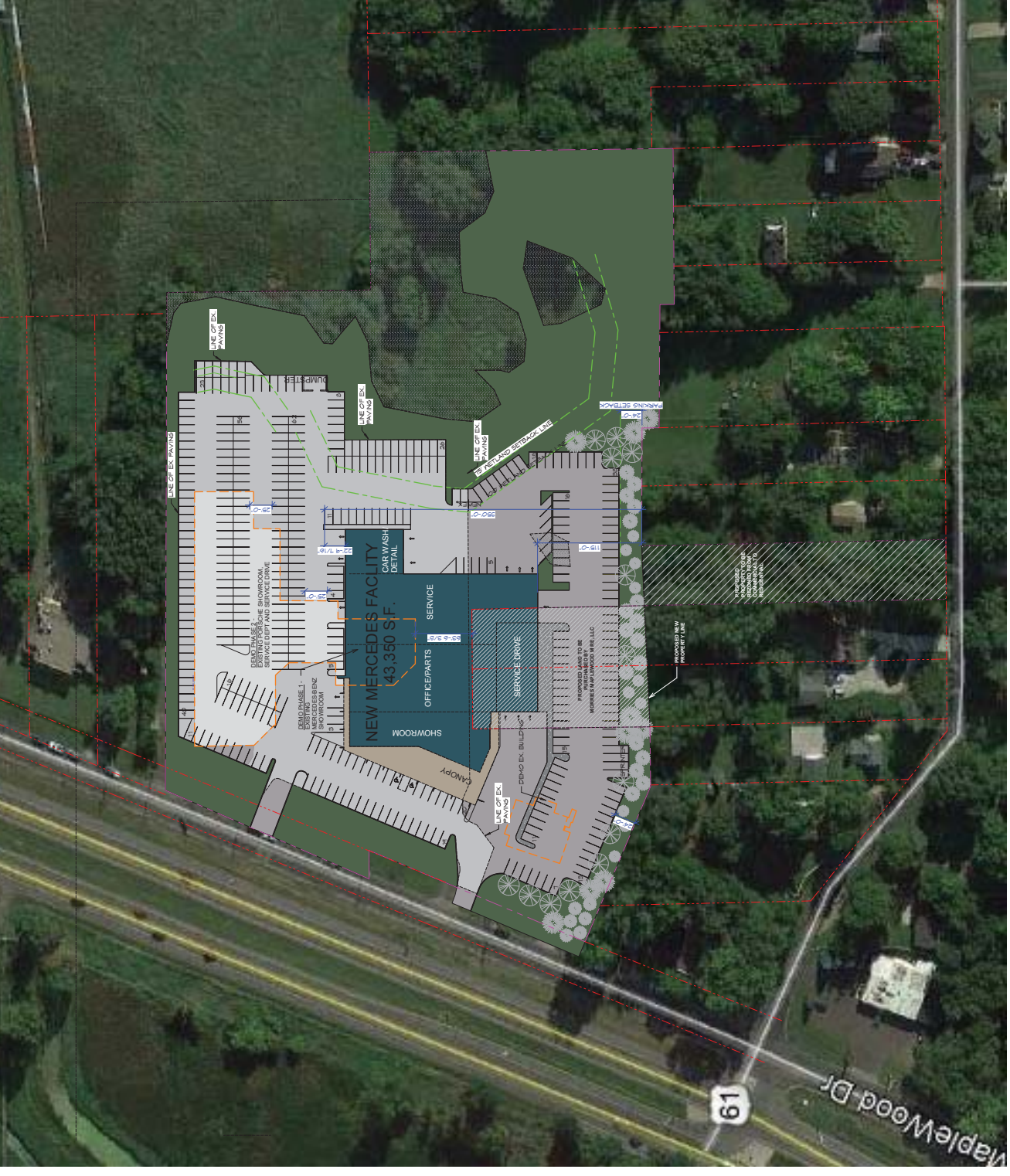
OVERALL SITE PLAN TOTAL PARKING STALLS: 427